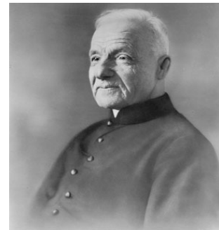
" Blessed be Saint Brother Andre"

Throughout the last few decades, some 10 million people have signed petitions calling for his canonization. When Brother Andre died, witnesses said that nearly one million people braved the bad weather to pay their respects. The last hurdle in the canonization process was lifted by the Pope at the end of 2009 when he recognized a miraculous curing caused by Brother Andre's intervention.